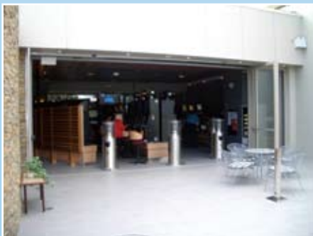
DUBBO RSL (Doors Stacked Open)

The Tracking system is designed for quiet and smooth operation making it completely noise free and it requires minimal maintenance. The ADIS unique bottom floor glide system is used at the floor level, that ensures for obstruction free movements across the doorway.