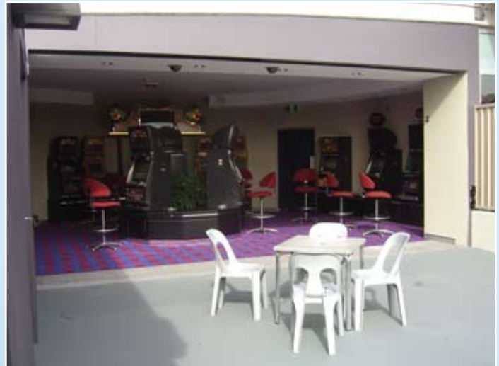
THE HANDLE BAR - SYDNEY OLYMPIC VELODROME (Doors Open)