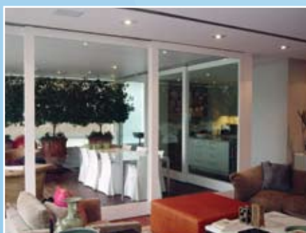
DARLING POINT PENTHOUSE (Doors Closed)