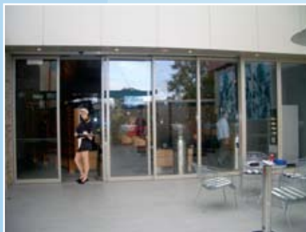
DUBBO RSL (Door in Auto Mode)