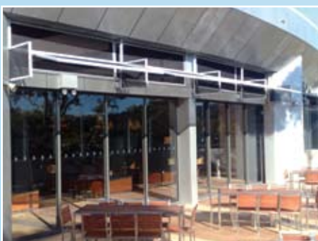
PITTWATER RSL (Doors Closed)