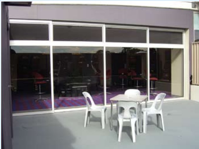
THE HANDLE BAR - SYDNEY OLYMPIC VELODROME (Doors Closed)

ADIS utilizes the latest technology in digital microprocessor technology giving the control unit multiple programmable modes including: provision to interface with building security & home automation systems and make operational adjustments as needed.