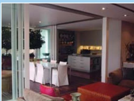
DARLING POINT PENTHOUSE (Doors Open)